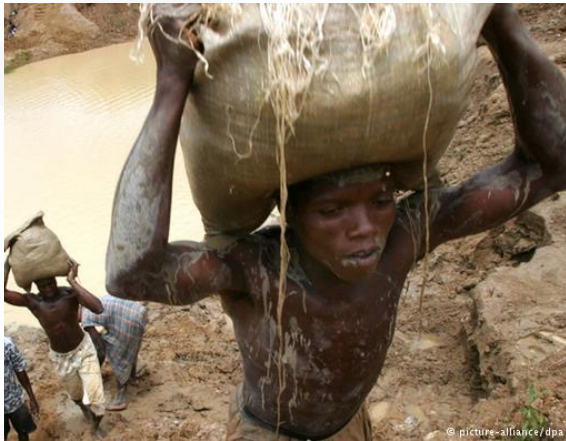
Child labor in Congo Cobalt Mine

The human and environmental impact of crude recycling methods in Africa is significant. E-waste contains hazardous material including arsenic, lead mercury, cadmium and chromium.