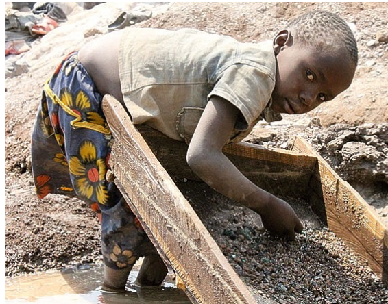
Cobalt mining in the Congo