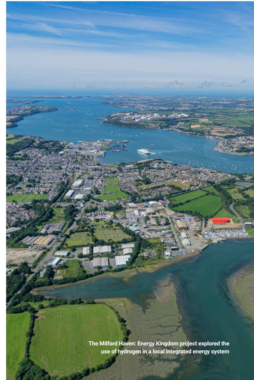
The Milford Haven: Energy Kingdom project explored the use of hydrogen in a local integrated energy system