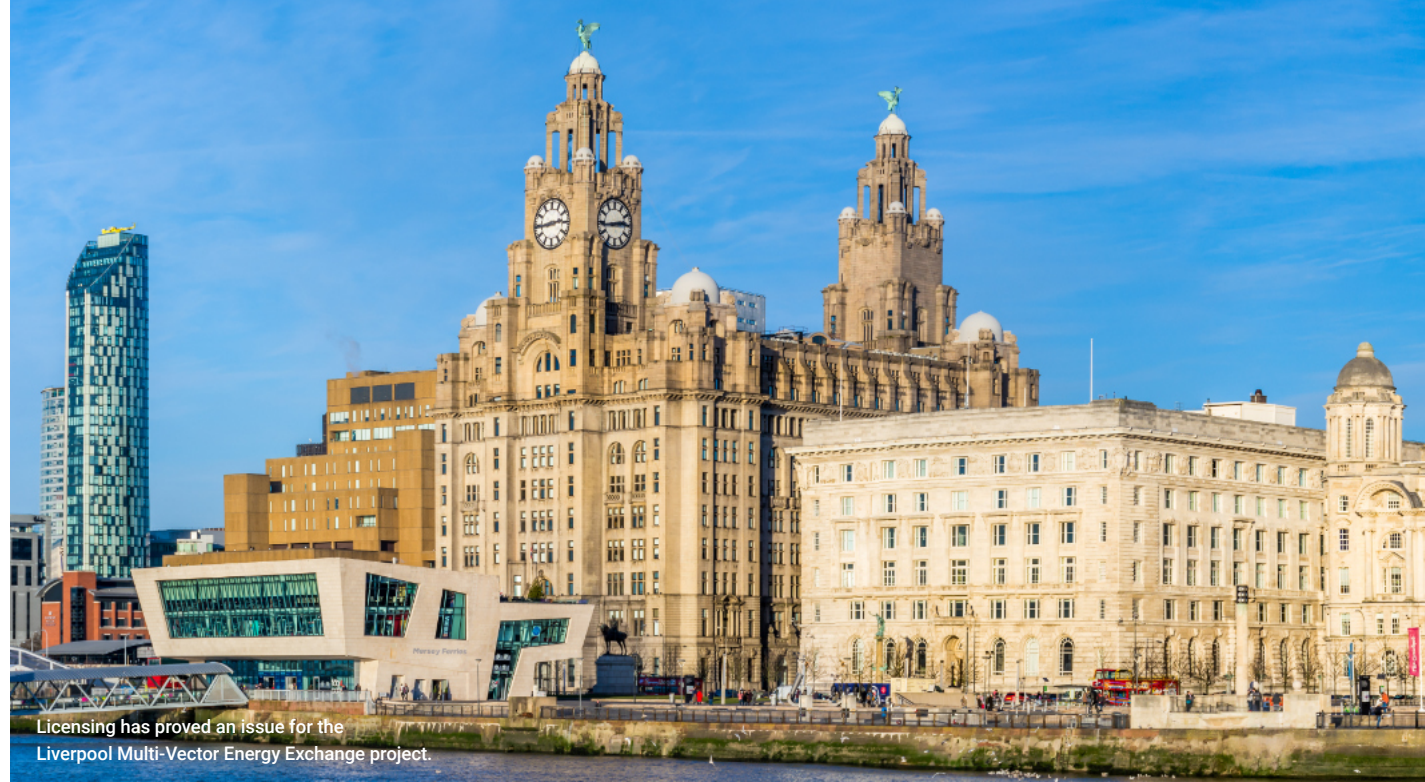
Licensing has proved an issue for the Liverpool Multi-Vector Energy Exchange project.

The UK energy system still operates mainly under the supplier hub model , which requires all energy transactions to go through a licensed energy supplier.