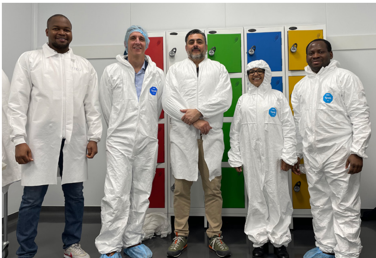
Figure 6: The delegation ready to go into the clean room facility where Open Cosmos assembles their satellites.

Open Cosmos is a satellite manufacturing company housed by the Satellite Applications Catapult, using clean room facilities to manufacture and test satellites. This visit was a highlight of the tour, for the following reasons: