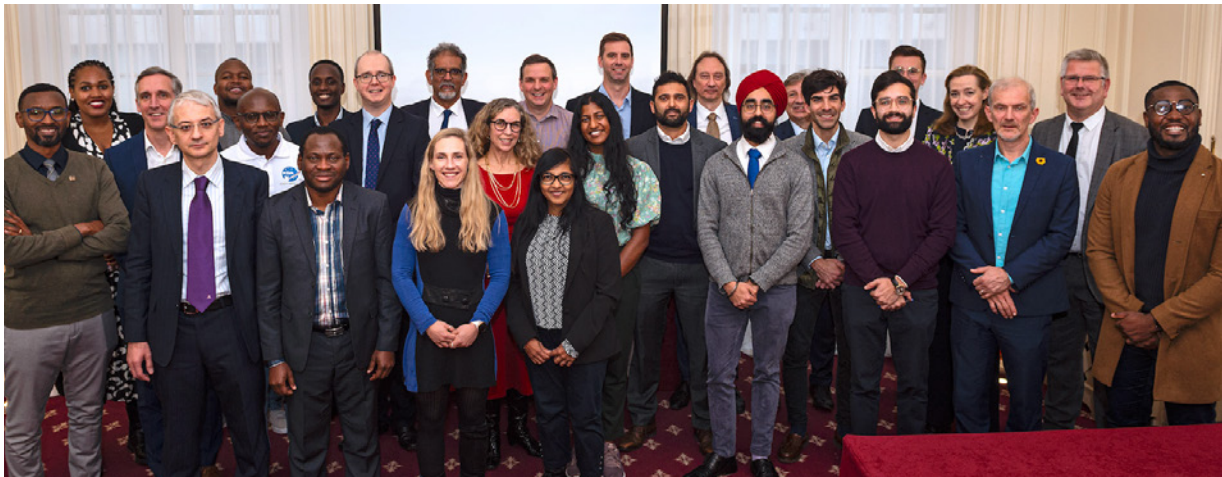
Figure 2: Group photo of the delegates and UK guests at the Space Sustainability event

Space sustainability was the beginning point of the tour, due to its importance for the survival of the sector. The Earth Space Sustainability Initiative (ESSI) is pioneering the design of the regulations around this and has a good understanding of the industry players involved in making this happen. For this event, ESSI brought these players together to paint a picture for the delegates on how this strategy is being developed, and what to keep in mind for their own strategies.