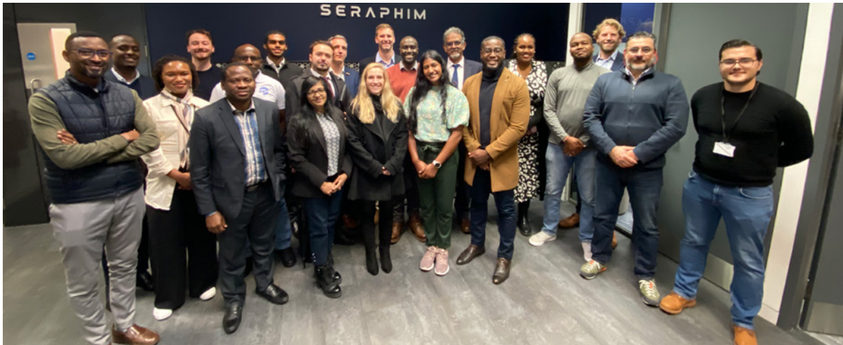
Figure 4: The delegation and hosts at Seraphim Space who specialise in “turning science fiction into science fact”

As an investor and accelerator only focused on space technologies, Seraphim Space gave the delegation a good understanding on how they manage and grow their portfolio, and what the opportunities are in terms of investment.