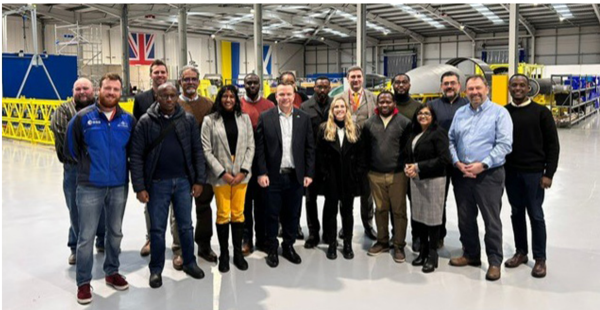
Figure 8: The delegation in the Skyrora factory with the hosting team

The delegation was joined by CEO of the SaxaVord Space Port, the location where these rockets are launched from British soil. Below captures a summary of the information they shared on their business offering, constraints, and future plans.