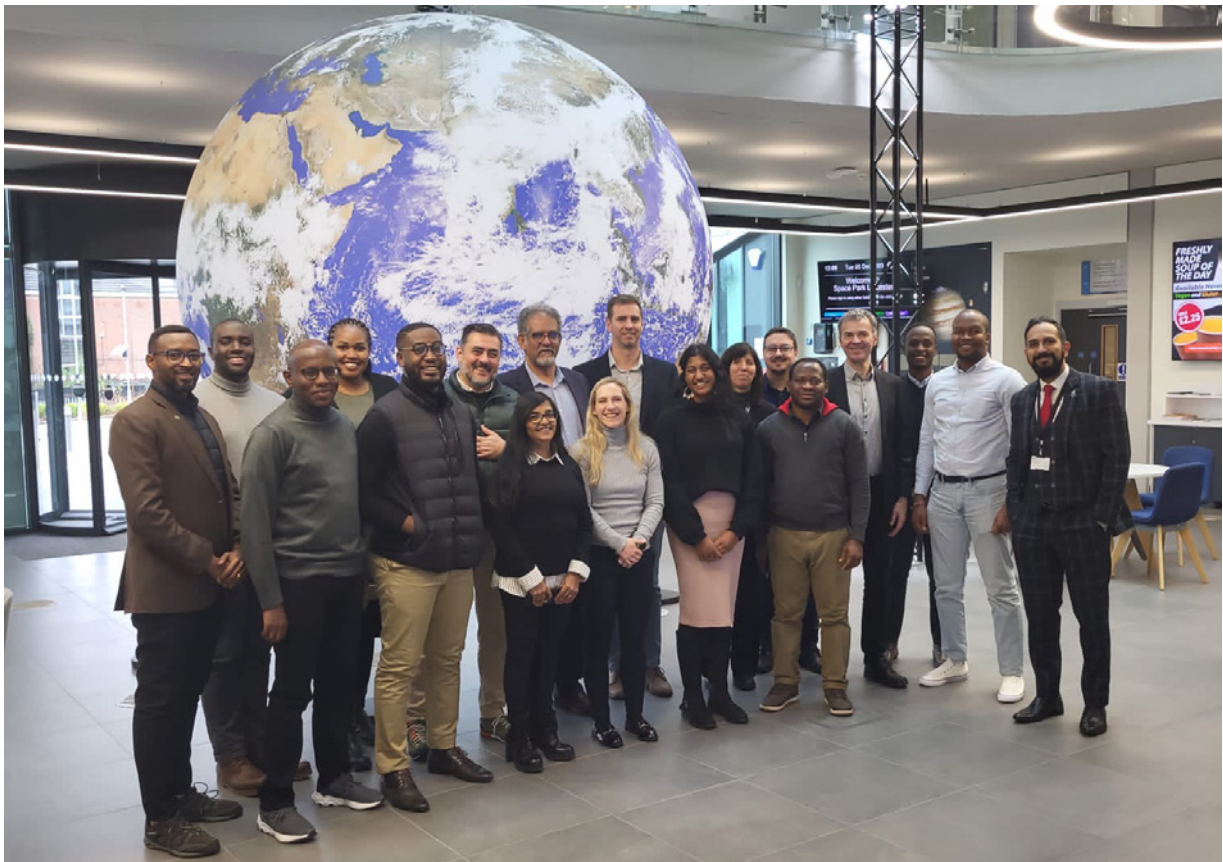
Figure 5: The delegation and hosts at Space Park Leicester