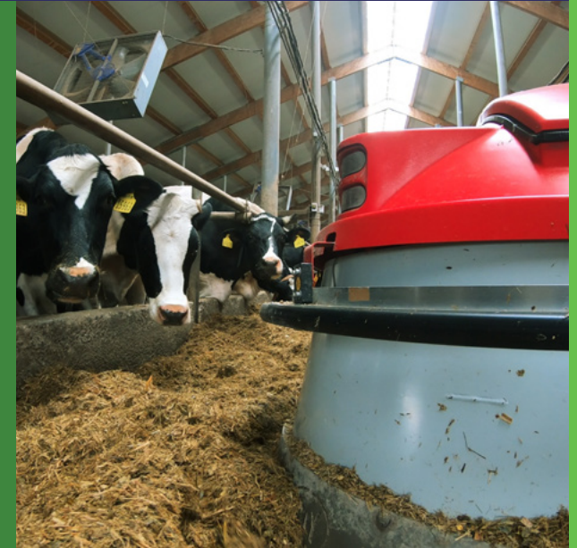
AI-enabled livestock monitoring in action

They were able to establish, develop and test automation and analysis software to improve effectiveness for monitoring both cow health and fertility.