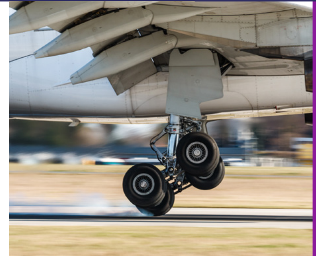
Electric brake actuators allow for lighter aircraft

The development of this new brake powerpack enables significant improvements to build time, cost and mass improvements, and will help to improve fuel efficiency and reduce emissions in aircraft as well as having the potential to create efficiencies across other modes of transportation.