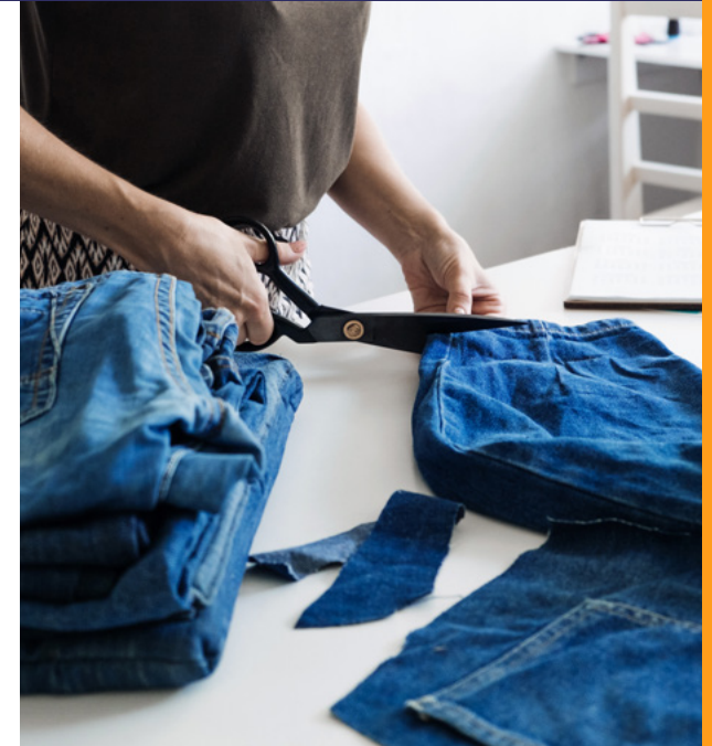
Enabling net-zero garment production

Undertaking this feasibility study allowed Weffan to test its technology concept, market and commercial viability while engaging with UK and EU industrial partners to understand how their technology could integrate into existing supply chains.