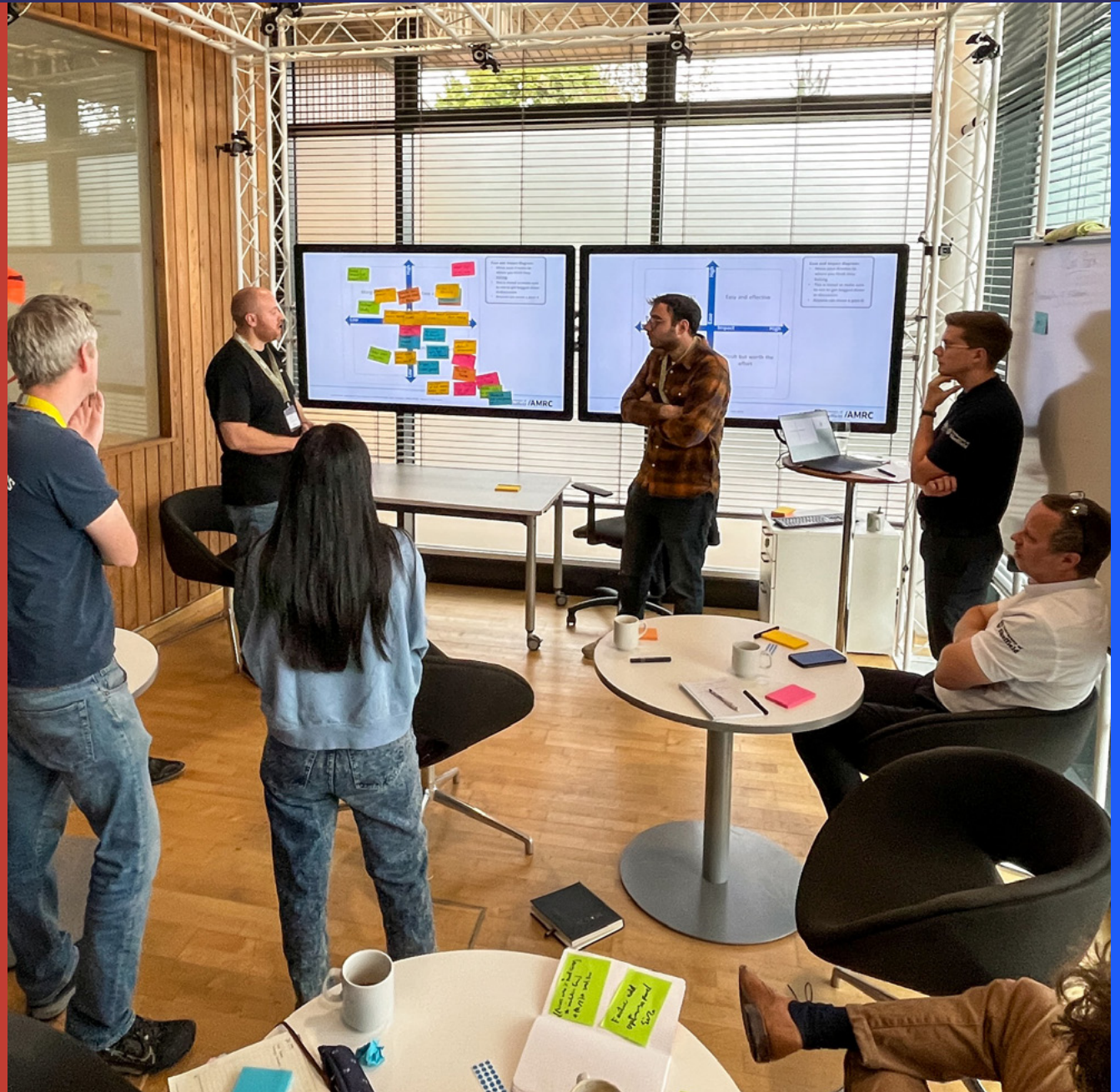
Let Zero planning meeting

Our programme activities ensure we're able to generate better data on the performance of a building before and after it has been upgraded, to help accelerate the adoption and trust in new solutions.