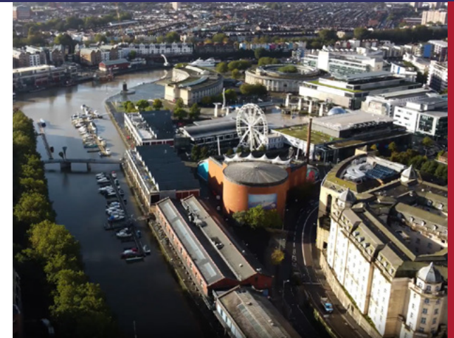
Bristol is helping lead UK decarbonisation

With around 400 local authorities across the nation, the learnings from Bristol Mission Net Zero will be key in creating a system of insights that will help them reach the first milestones of their own net zero delivery.