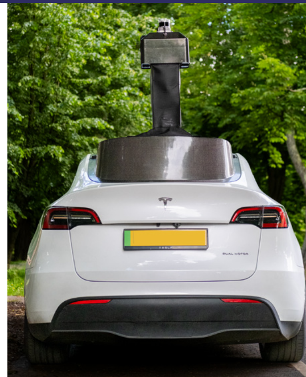
BESS attached to an AI-powered Tesla

This system has been called for by the sector for a long time and will rapidly accelerate data getting into the hands of the right people to lead retrofit projects.