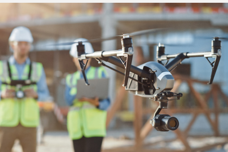
Remote drone aircraft under testing

Projects funded through these programmes will use new classes of electric, hydrogen and autonomous aircraft to transform how we connect people, deliver goods and provide services across the UK.