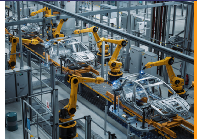
Advancing electric vehicle manufacturing

of funding secured through the Driving the Electric Revolution Challenge