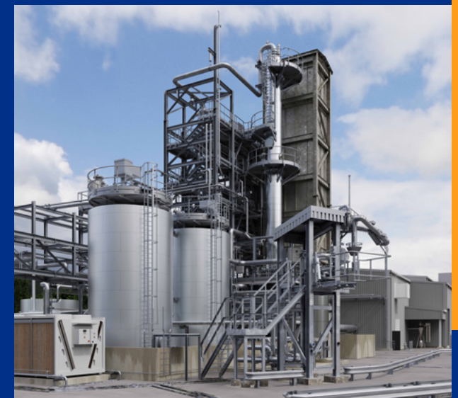
The ReNew ELP facility at Wilton, Teesside

Through the Smart Sustainable Plastic Packaging Challenge, Innovate UK's support is helping projects like this lower commercial barriers by enabling greater testing and validation of the technologies being developed.