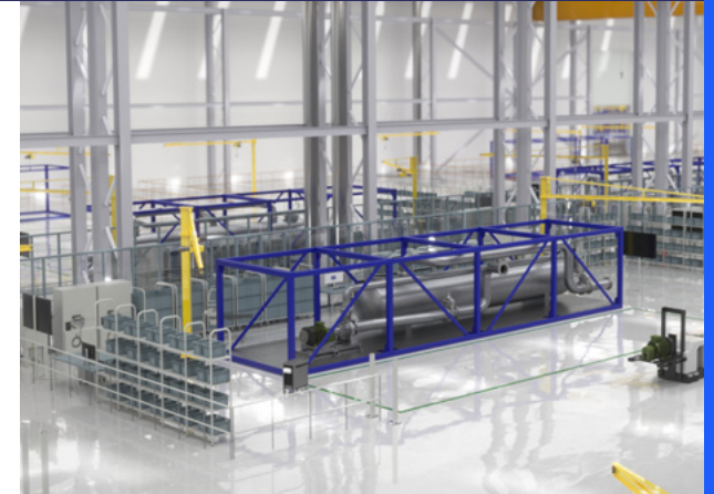
Artist's render of SMR (interior)

ITH Bolting Technology UK presented a maintenance-free bolting technology that stood out to the assessing team, leading to a relationship being formed between the company and EDPR, supported by Innovate UK.