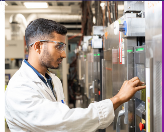
Development of silicon-based EV batteries

Nexeon has gone on to further evaluate the potential of higher-density, silicon-based battery materials leading to enhanced performance across the automotive industry, consumer electronics, power tools and beyond.