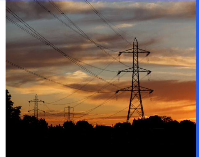
An electricity pylon

Also funded through the SIF is the Crowdflex-Beta project, led by the National Energy System Operator (NESO), which is developing digital tools to help unlock full energy supply chain flexibility.