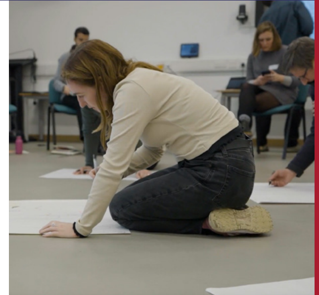
Cosysense project development session

Focusing on people's thermal satisfaction to create power and emissions savings allows the Cosysense system to meet a wide range of needs in one business model and provide benefits across the ecosystem of building users.