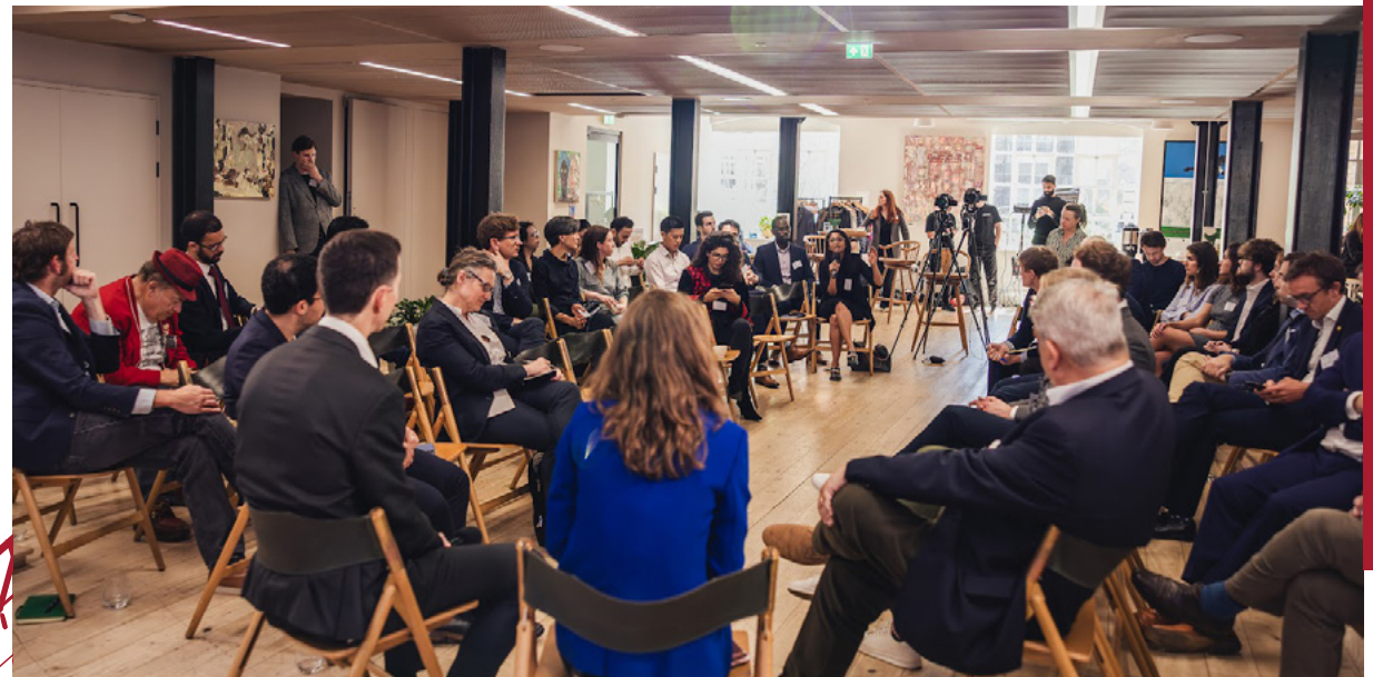
Innovate UK is accelerating net-zero adoption at a systems level

Exported over £223m of goods and services